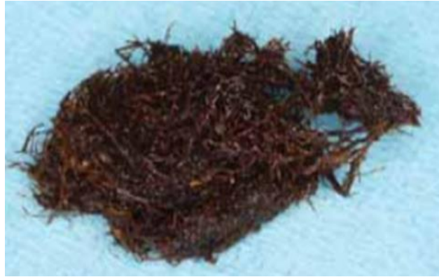
Figure 1. Alvogyl

antibacterial agent. This paste-like consistency is achieved by mixing a large number of different compounds with the active ingredients already mentioned ( Figure 1 ). This table lists Alvogyl's manufacturer-supplied composition. Researchers discovered that Alvogyl slowed the healing of extraction sockets [9, 10].