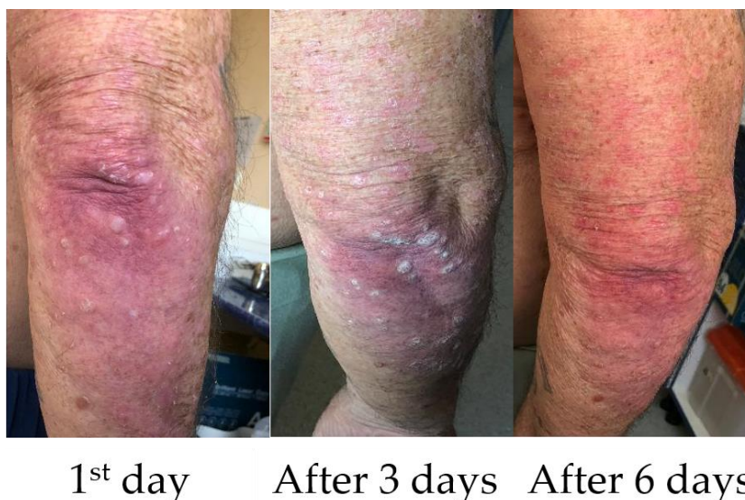
Figure 4. Clinical aspects of the case – Psoriasis lesions showing a slight improvement in the local area following the treatment with hydrogel based on a mixture of Ocimum basilicum and Trifolium pratense extracts.

We started local treatment with the hydrogel formulation based on Ocimum basilicum and Trifolium pratense extract twice a day, in the morning (after the shower) and the evening before sleep. We noticed an improvement in patient condition starting with day 3 of treatment, but more obvious after 6 days of treatment ( Figure 4 ).