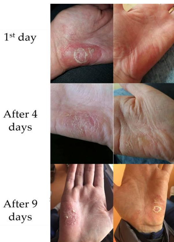
Figure 2. Clinical aspects of the case - Dyshidrotic eczema, highlighting visible improvement of the lesions following treatment with a cream formulation based on Ocimum basilicum and Trifolium pratense extract.

Upon applying the cream twice a day, the patient's degree of tolerance was very good, the patient did not report any observed side effects. The advantages of using the cream formulations based on Ocimum basilicum and Trifolium pratense extracts rely on avoiding the corticosteroids and the subsequent side effects (atrophy, purpura, and other systemic reactions) [38].