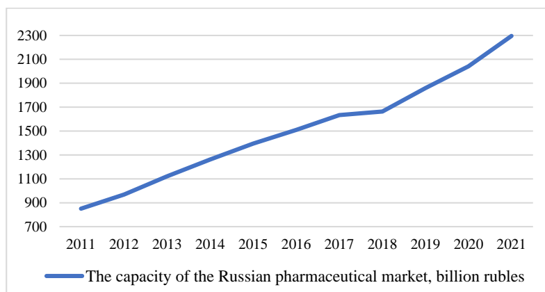
Figure 1. Capacity of the Russian pharmaceutical market, billion rubles, from 2011 to 2021

In 2020, a new incentive in the form of COVID-19 coronavirus infection was added to the development of the global and Russian drug market. A huge number of cases, massive use of personal protective equipment, the development and sale of vaccines, and various methods of prevention and treatment of the disease – all made COVID-19 the main factor that influenced the development of the pharmaceutical market in 2020 [8-10]. The dynamics of the Russian market in relative terms amounted to 9.8% instead of the predicted 5% ( Figure 1 ).