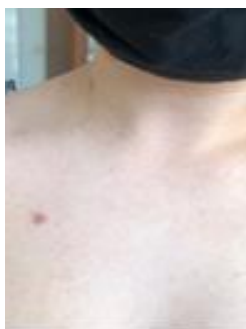
Figure 1. Cutaneous neurofibroma

lait spots (more than 10) disseminated over the anterior and posterior thorax, neck, abdomen, upper and lower limbs, thoracic neurofibromas, and axillary freckles ( Figures 1-4 ).