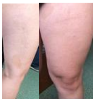
Figure 4. Café au lait spots on the lower limbs