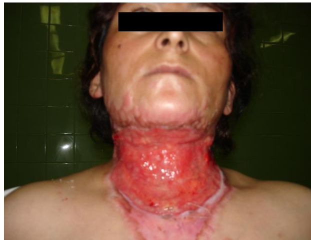
Figure 2. Preoperative view of flap in a case after the contracture release.